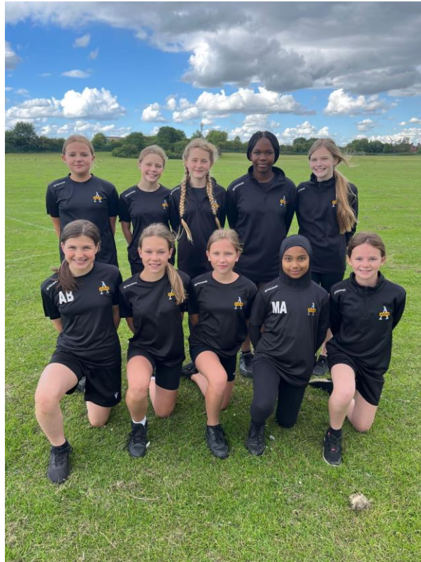
Communication with the team