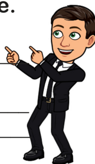
Image of the person